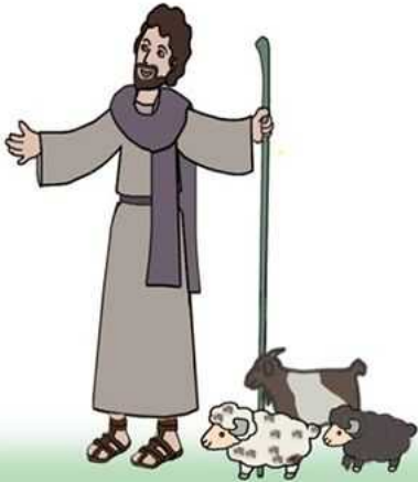
얼룩염소, 얼룩양, 검정양